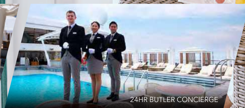
24HR BUTLER CONCIERGE