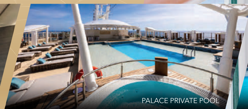
PALACE PRIVATE POOL