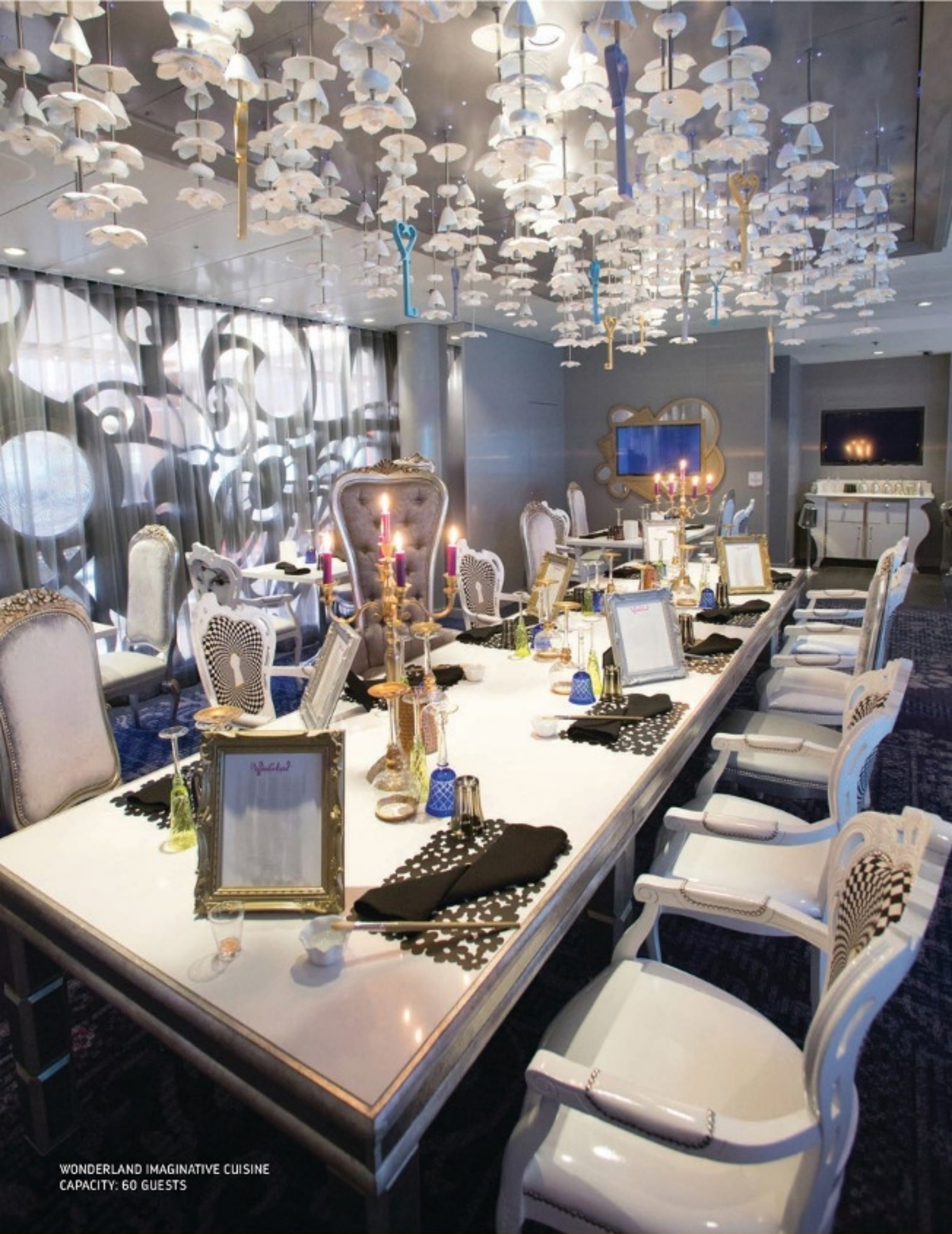
WONDERLAND IMAGINATIVE CUISINE CAPACITY: 60 GUESTS