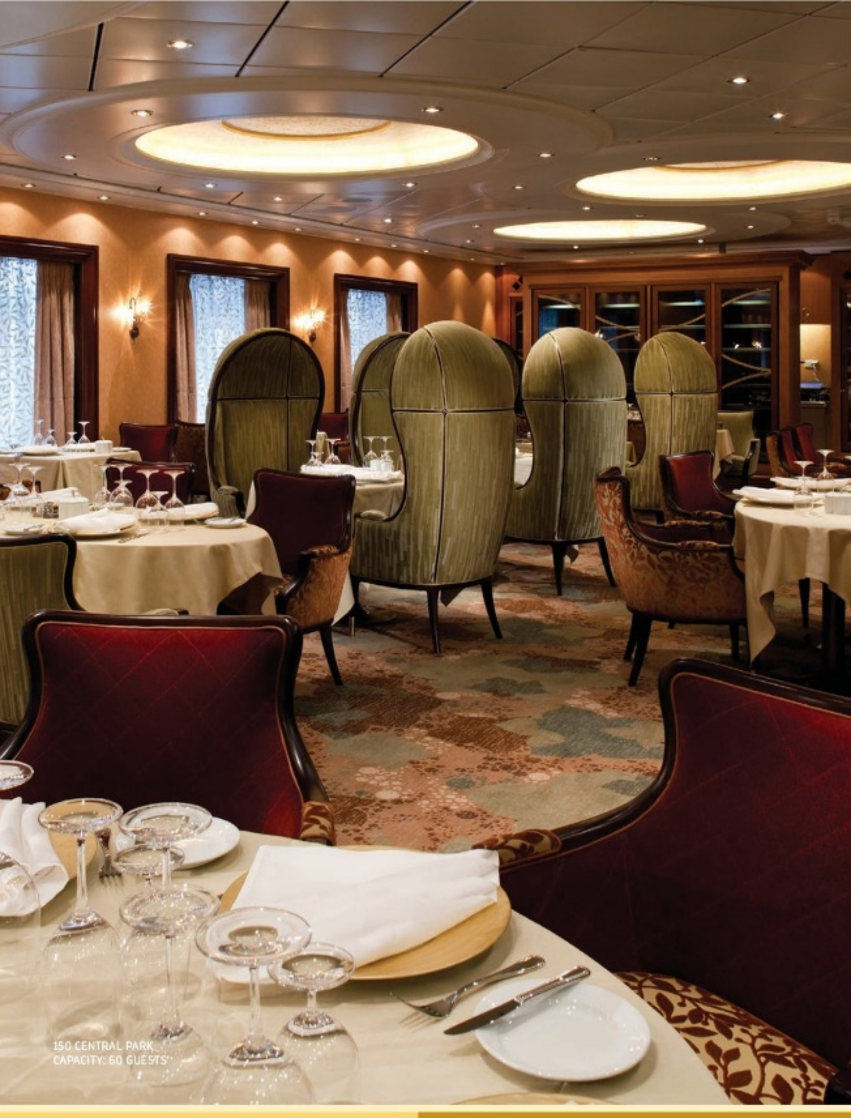
150 CENTRAL PARK CAPACITY: 60 GUESTS