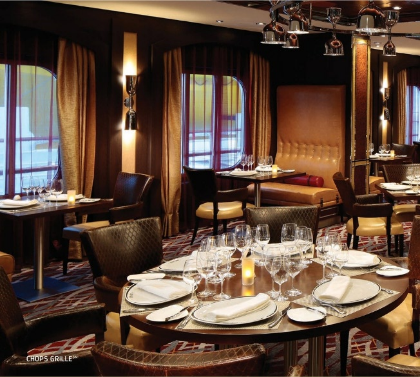
CHOPS GRILLE SM