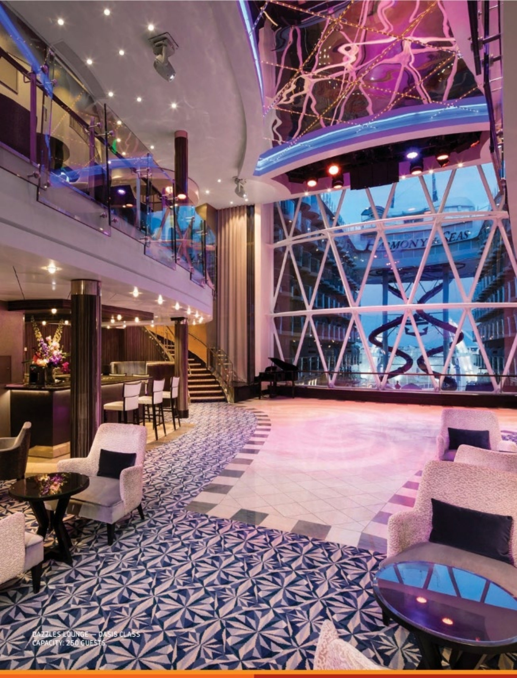
DAZZLES LOUNGE — OASIS CLASS CAPACITY: 250 GUESTS