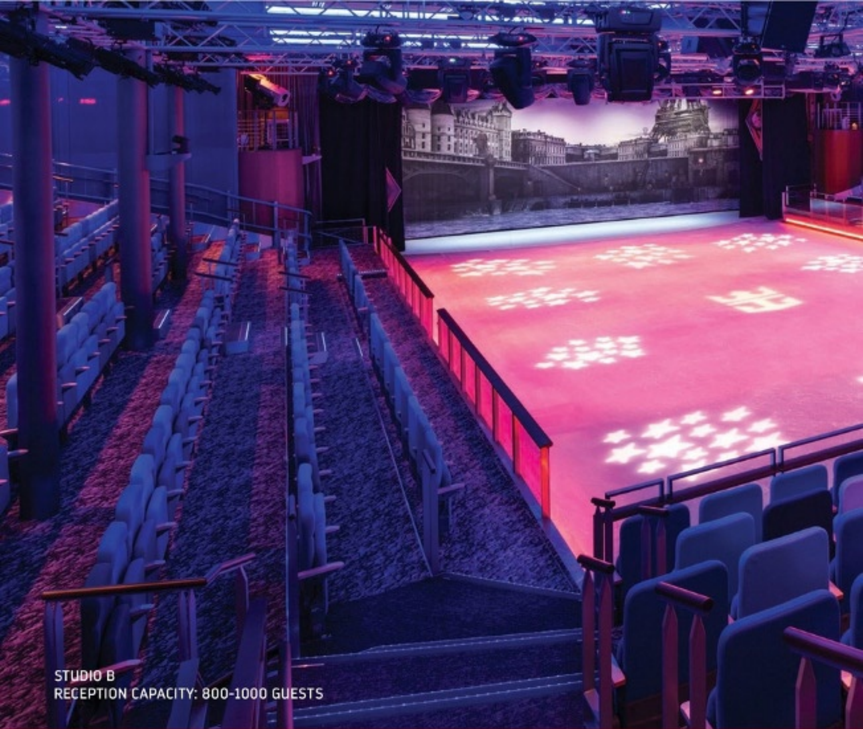
STUDIO B RECEPTION CAPACITY: 800-1000 GUESTS