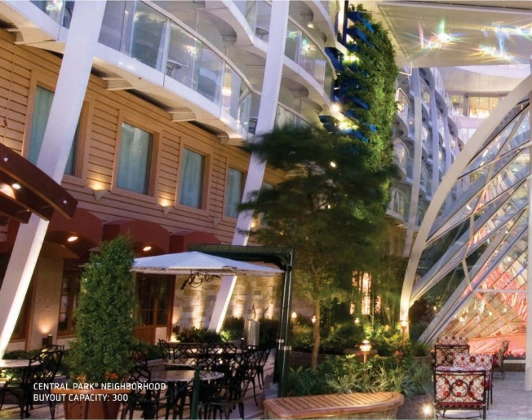
CENTRAL PARK® NEIGHBORHOOD BUYOUT CAPACITY: 300