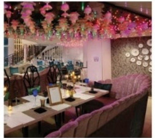
Wonderland Imaginative Cuisine