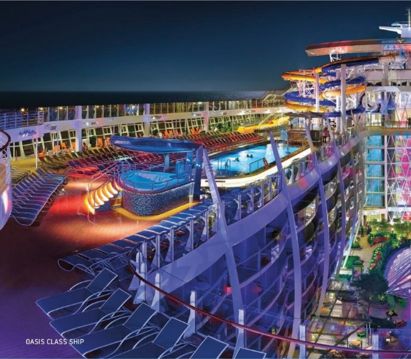
OASIS CLASS SHIP