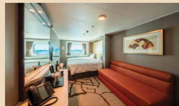
OCEANVIEW STATEROOM From 16 - 35 sq.m | Max Occupancy 2 - 4 | Deck 5/9/10/11/12/13 2 Single Beds / 2 Single Beds + 1 Single Sofa Bed / 2 Single Beds + 1 Single Sofa Bed + 1 Ceiling Pullman Bed