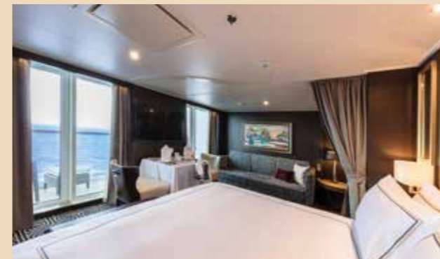
PALACE SUITE From 37 sq.m | Max Occupancy 4 | Deck 13/15/16/17 1 Queen-size Bed + 1 Double Sofa Bed