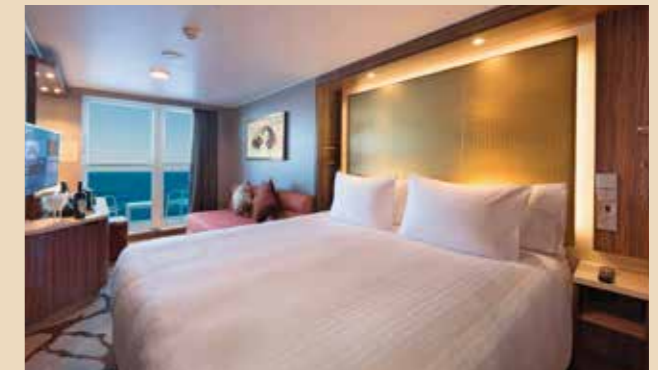
BALCONY / BALCONY DELUXE STATEROOM From 20 sq.m | Max Occupancy 3 - 4 | Deck 8/9/10/11/12/13/15 1 Queen-size Bed + 1 Single Sofa Bed / 1 Single Sofa Bed + 1 Ceiling Pullman Bed From 22 - 28 sq.m | Max Occupancy 3 - 4 | Deck 8/9/10/11/12/13/15 1 Queen-size Bed + 1 Single Sofa Bed / 1 Single Sofa Bed + 1 Ceiling Pullman Bed