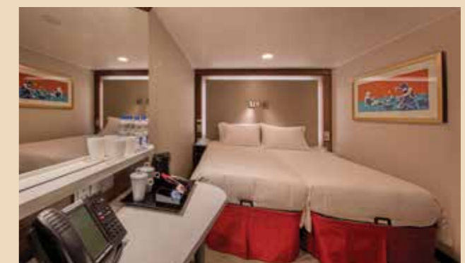
INTERIOR STATEROOM From 13 - 14 sq.m | Max Occupancy 2 - 4* | Deck 5/8/9/10/11/12/13/15 2 Single Beds / 2 Single Beds + 1 Ceiling Pullman Bed / 1 Single Bed + 1 Pullman Bed + 1 Double Sofa Bed