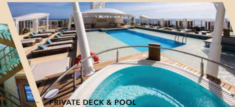
PRIVATE DECK & POOL

Privileges are subject to change without prior notice.