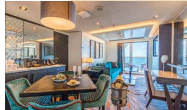
PALACE DELUXE PREMIUM From 41 - 61 sq.m | Max Occupancy 4 | Deck 9/10/11/12/13/15 1 King-size Bed + 1 Double Sofa Bed