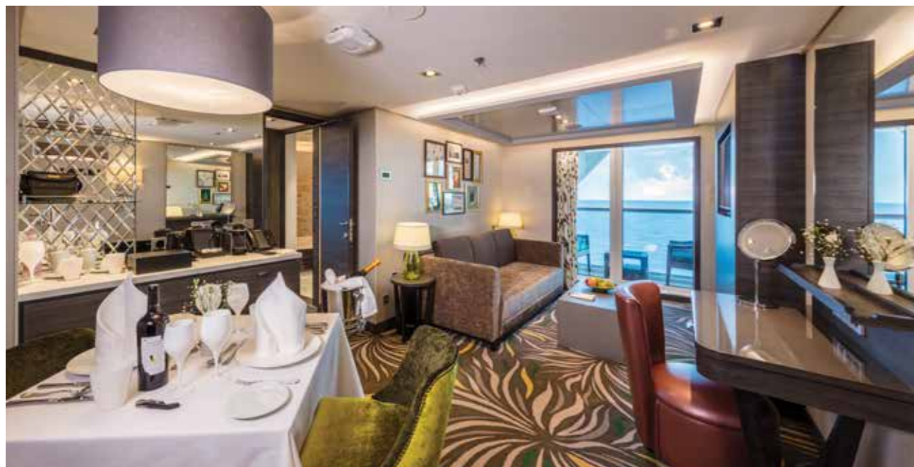
PALACE PENTHOUSE Approx. 56 - 115.4 sq.m | Max Occupancy 4 - 6* | Deck 13/16 1 King-size Bed + 1 Double Sofa Bed / 1 Queen-size Bed + 2 Double Sofa Beds / 1 Queen-size Bed + 1 Double Sofa Bed