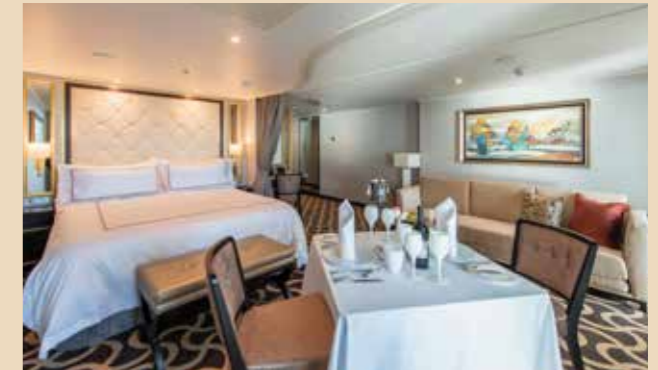
PALACE DELUXE SUITE From 41 sq.m | Max Occupancy 4 | Deck 15 1 Queen-size Bed + 1 Double Sofa Bed