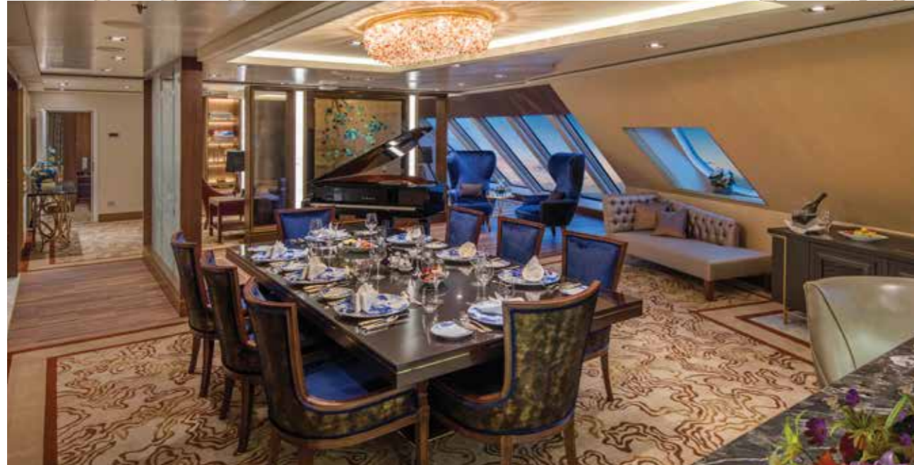
PALACE VILLA Approx. 224 sq.m | Max Occupancy 6 | Deck 17 1 King-size Bed + 1 Queen-size Bed + 1 Double Sofa Bed