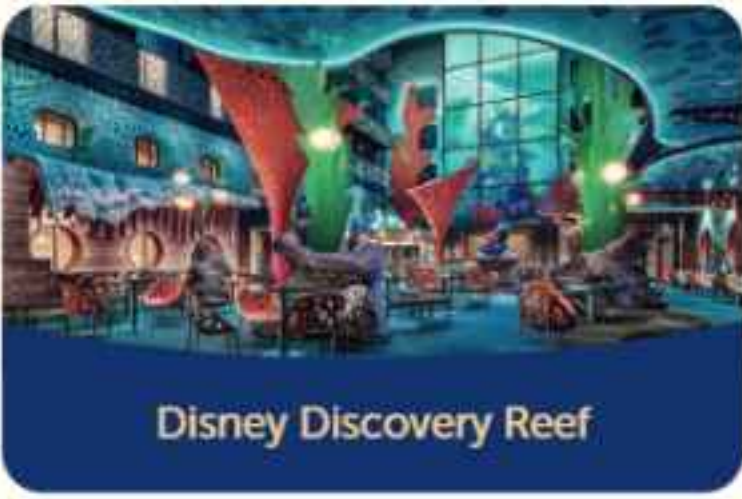
Disney Discovery Reef