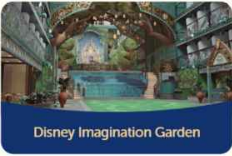
Disney Imagination Garden